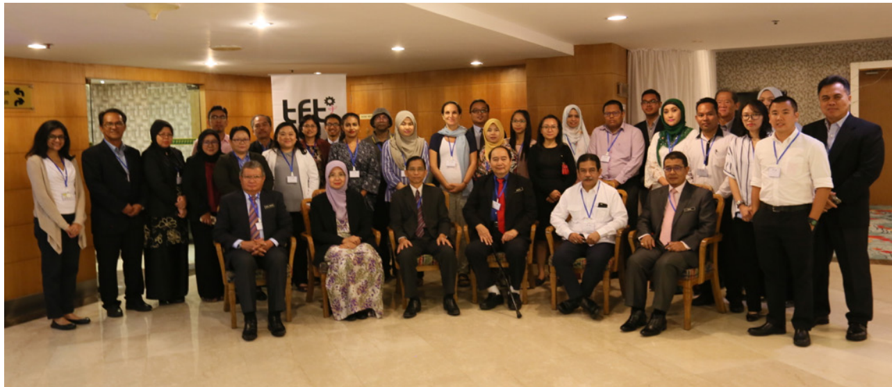
Image: Earthworm Foundation, SUHAKAM and representatives of government agencies, government-linked companies and academic institutions.

The first discussion session focused on experiences and perspectives from government officials, government-linked companies, consulates and experts from academic institutions concerning the situation of children in Sabah in general, and in the plantation sector in particular.