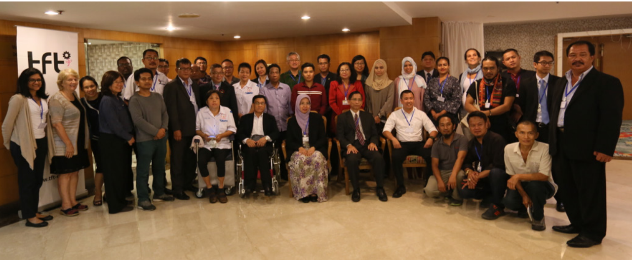
Image: Earthworm Foundation, SUHAKAM and representatives of civil society organizations.

The second open discussion focused on an exchange of views with representatives of civil society organisations.